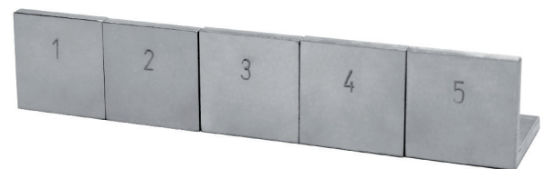
Five aluminium angles