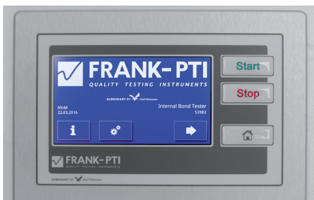
Integrated digital display and controls