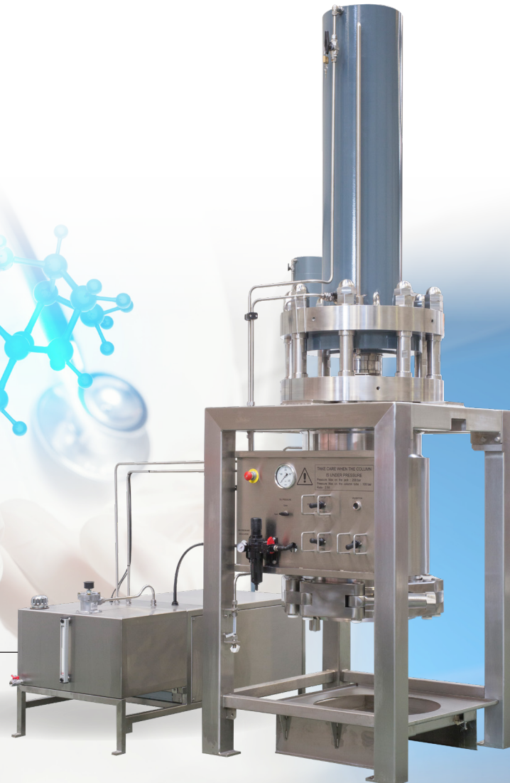
Prochrom ® Column LC450