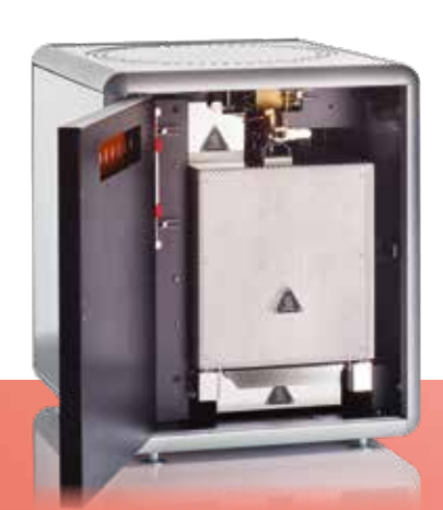
DIRECT TEMPERATURE PROGRAMMED DESORPTION (DIRECT TPD)

UNICUBE uses the proprietary direct TPD technology to chromatographically separate the combustion gases prior to detection in a highly sensitive thermoconductivity detector. The temperature program for the gas separation is controlled by a sensor positioned on the inside of the direct TPD column - directly in the gas stream. This setup has unique benefits such as very sharp peaks through direct control of the gas desorption temperature and guaranteed baseline separation of all gases - even for extreme elemental ratios. This makes the direct TPD technology capable of resolving C:N and C:S ratios of up to 12,000:1. The distinct peak separation assures absolutely reliable and trouble-free data acquisition. Elementar's unique direct TPD columns are optimized to provide unmatched robustness and longevity compared to classic GC columns.